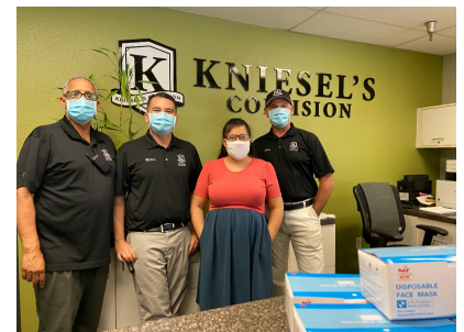
Kniesel's Collision on Power Inn Road is covered!